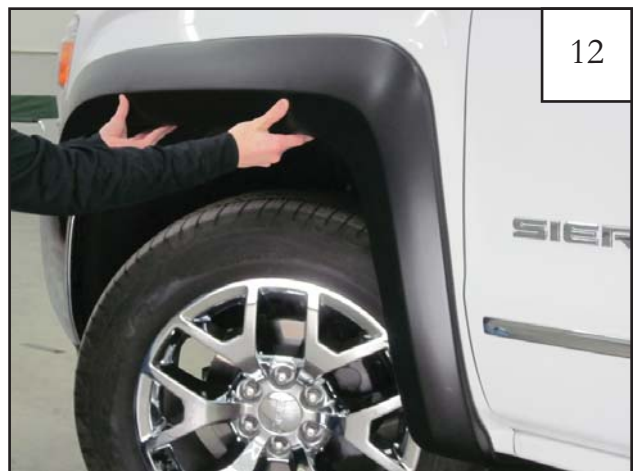
Hold Front Flare up to wheel well to confirm fit. Do not install fasteners at this time.