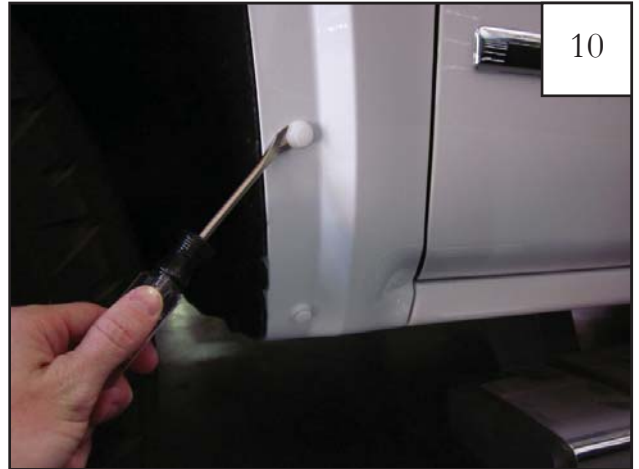
Use a pry tool to remove any remaining factory fasteners that may have stayed on the vehicle during the removal process.