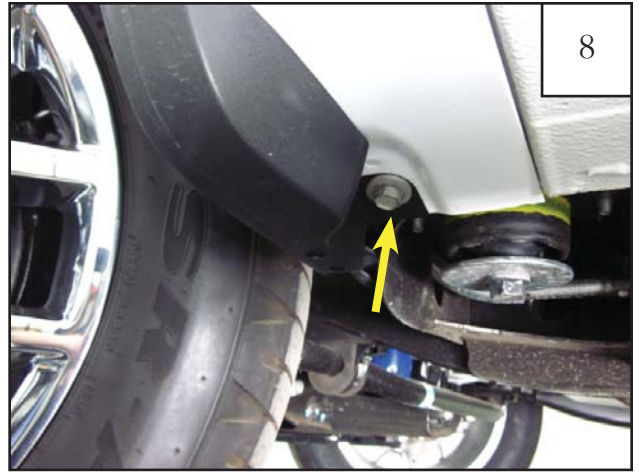
Remove fastener from rear underside of factory wheel arch molding using a 1/2" socket and wrench. Save for reinstallation.